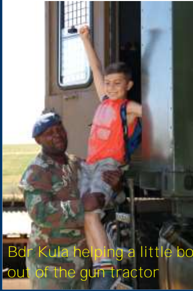
Bdr Kula helping a little boy out of the gun tractor