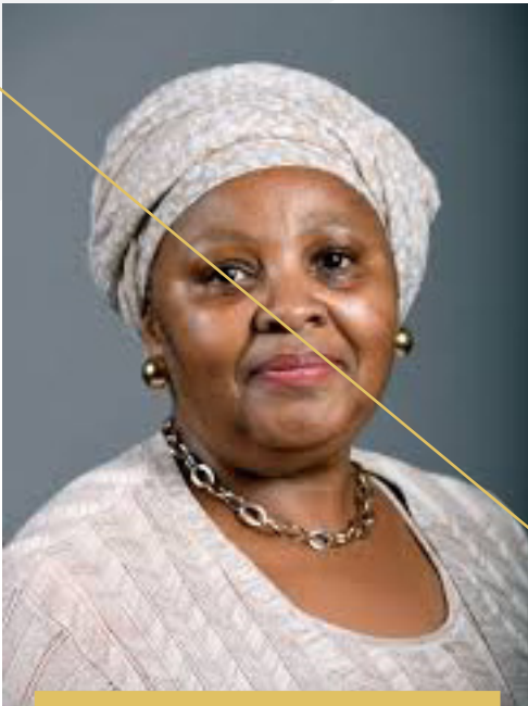
Ms. NN MAPISA-NQAKULA, MP Minister of Defence and Military Veterans

It is an honour for me to be accorded the opportunity, to present this Annual Report (AR) for the Department of Military Veterans (DMV). We present this AR against the backdrop of the country battling with a global Covid-19 pandemic. A pandemic that is ravaging human kind across the globe including our very own country, South Africa. Never before has the ANC-led democratic government been faced with such an enormous and deep-gong social, political and economic challenge as the Covid-19 pandemic has posed.