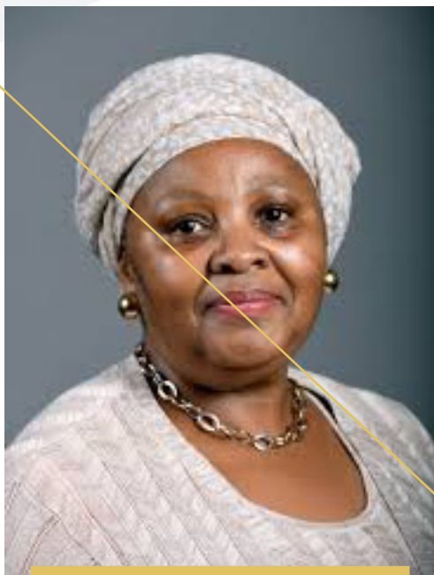
HON TSP MAKWETLA, MP Deputy Minister of the Department of Defence and Military Veterans

The Department celebrates a historic milestone of 10 years of functionality since its inception on 1 st April 2010. This was pre-cursed by the 2009 that followed the Resolution of the 52 nd Conference of the ruling party the ANC, held in Polokwane. Following that a Presidential Proclamation was made giving the political mandate for the establishment of the DMV.as a Department. Although progress has been significant but modest over the past ten years, there is still much work to be achieved with respect to ensuring that the DMV delivers effectively and efficiently on its mandate including the disbursement of the benefits stipulated in Section 5 of the Military Veterans Act 18 of 2011.