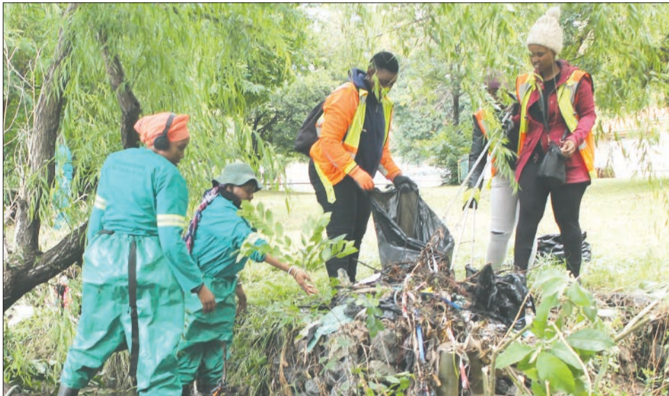
City Parks staff remove rubbish, standing on a tree that has blocked the spruit for years.