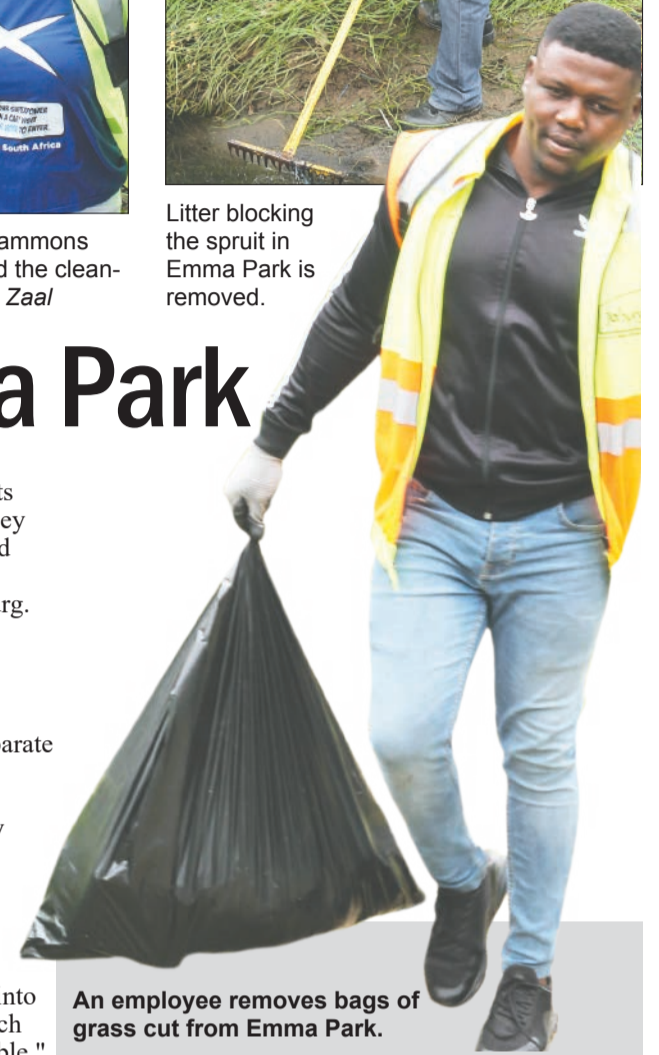
An employee removes bags of grass cut from Emma Park.

"Litter is an ongoing concern, however, after the first rains much of the litter accumulated over the dry season is washed into the spruits and dams, which makes the litter more visible."